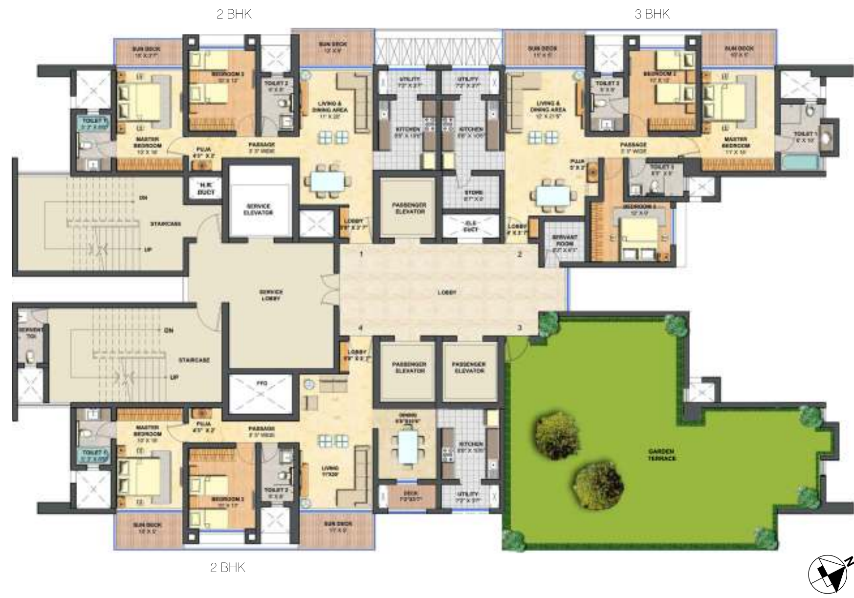
Floor Type F