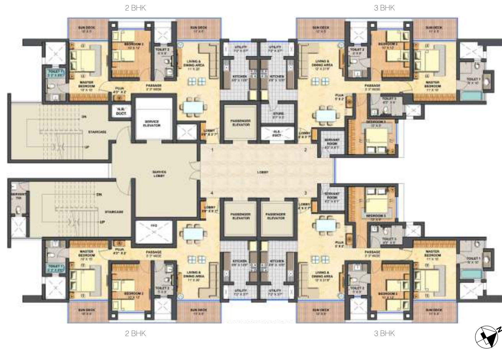
Floor Type A

10th, 14th, 18th, 22nd, 26th, 30th, 34th, 38th, 42nd, 46th Floor