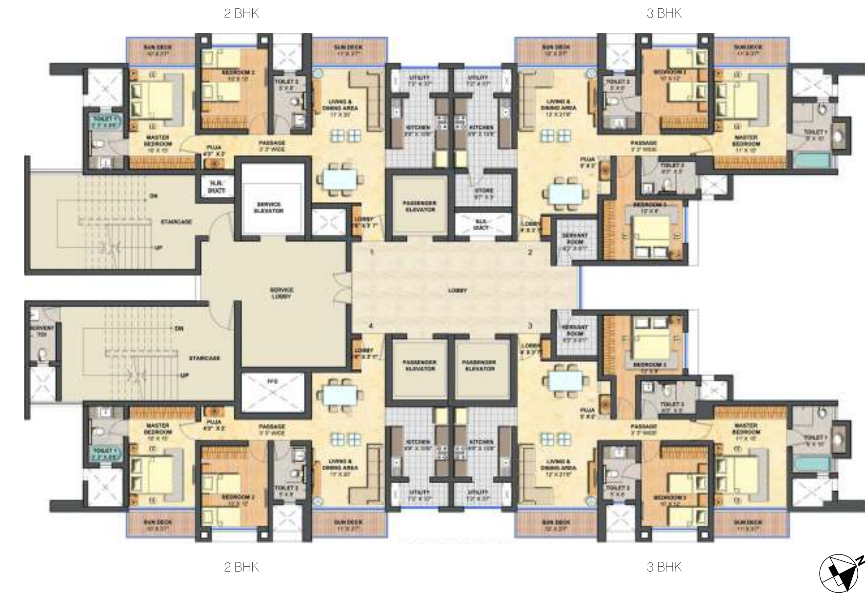
Floor Type B

11th, 15th, 19th, 23rd, 27th, 31st, 35th, 39th, 43rd, 45th, 47th Floor