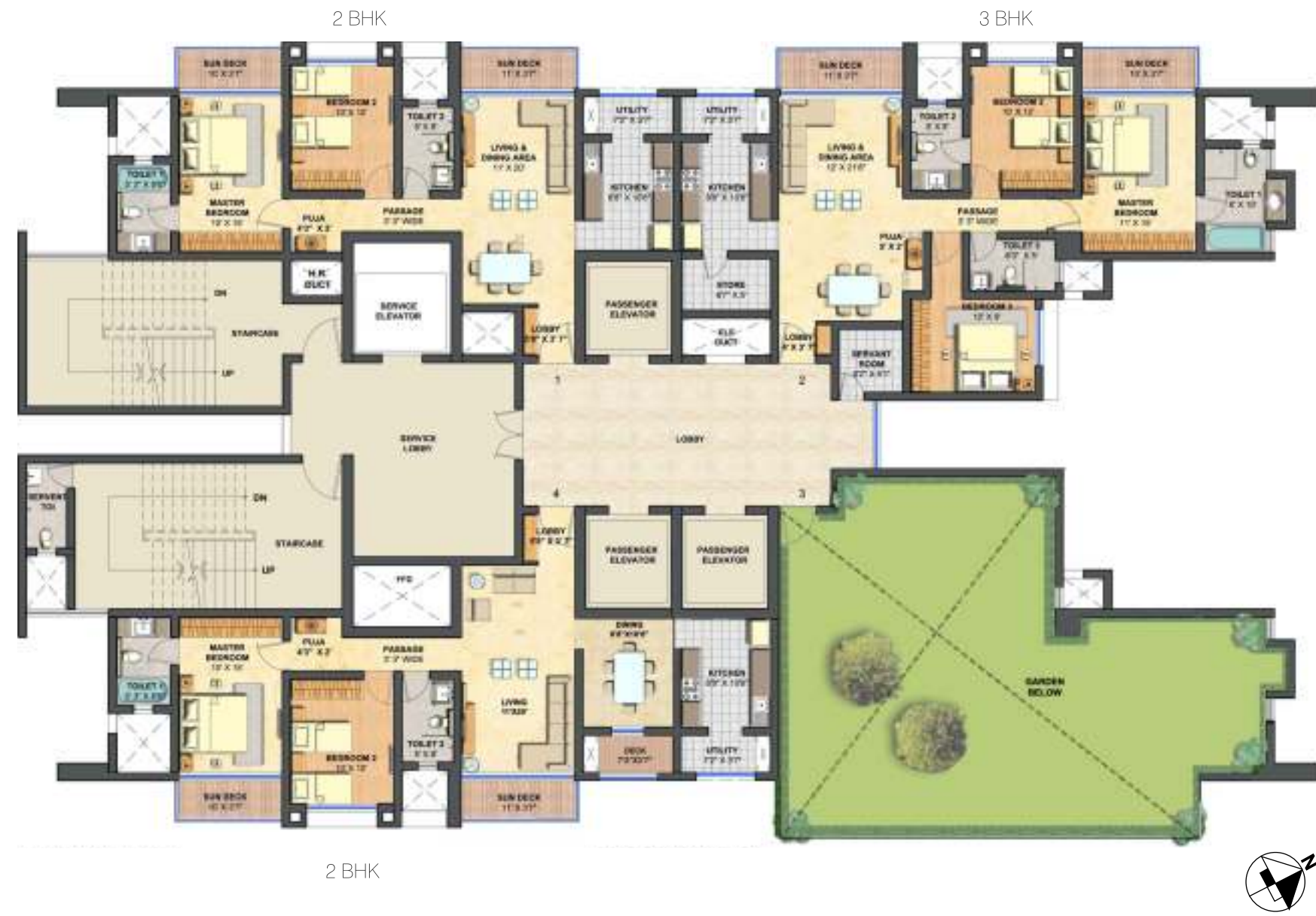
Floor Type G