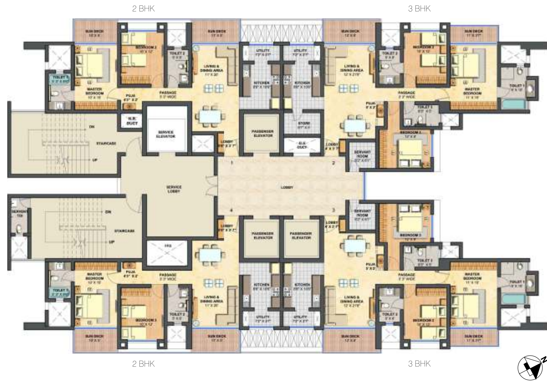
Floor Type C