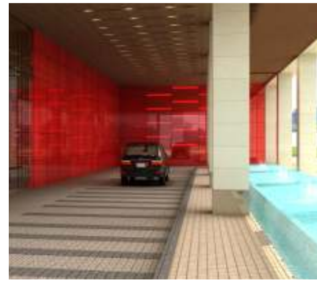
A close up of the Front Facade | Terrace Pavilion | Drop-off Point