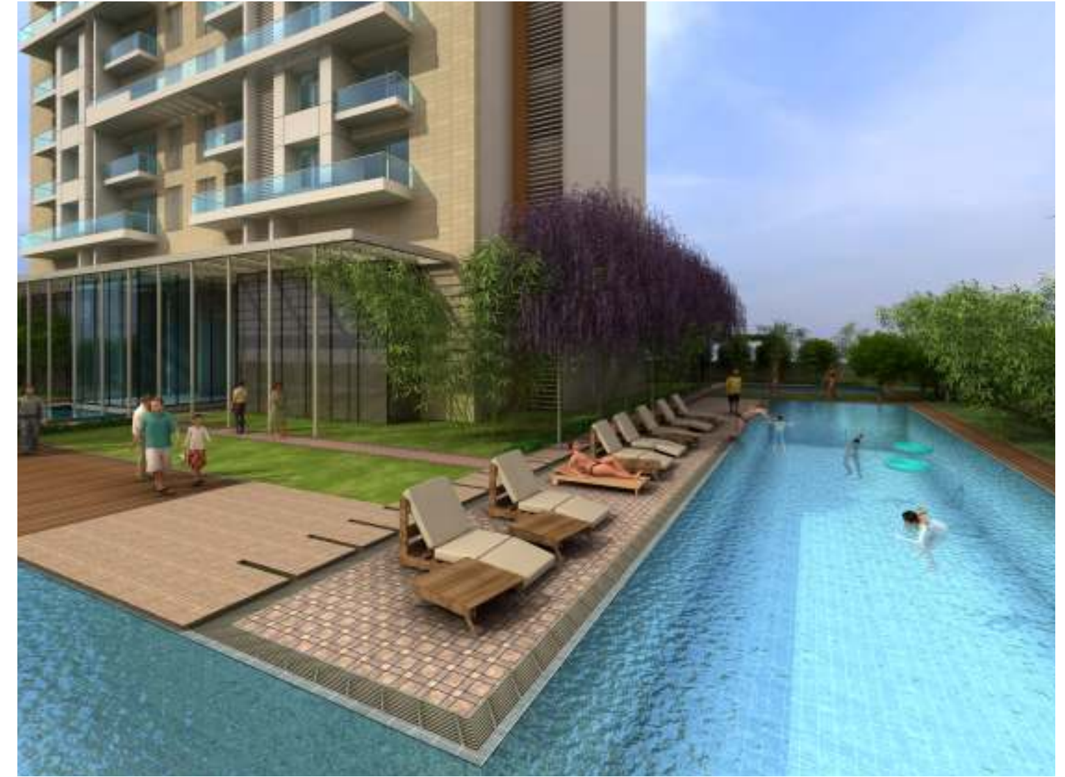
Club Level Swimming Pool